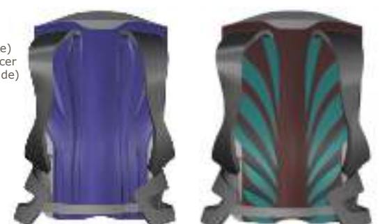
Fig. 5: Flow channel system AirStreamer concept (left side) and AirTurbulencer concept (right side)

The CFD analysis of the AirStreamer as well as the AirTurbulencer concept (Fig. 5) exhibit the potential to influence the convective heat transfer especially around the spine region in a positive way during cycling. However, the CFD study was focused on the velocity patterns as an indication for thermal performance, not taking the actual thermal behavior into account. The next step comprises a study with real athletes measuring the micro and the interlayer climate by means of temperature and humidity monitoring during cycling in a climate chamber. Such a study is necessary to confirm the findings of the CFD analysis.