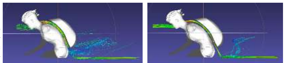
Fig. 3: Figure 3. Cross section view along sagittal plane of body center: Colour pattern indicates airstream velocity and turbulences (left side: AirStreamer concept; right side: AirTurbulencer concept)